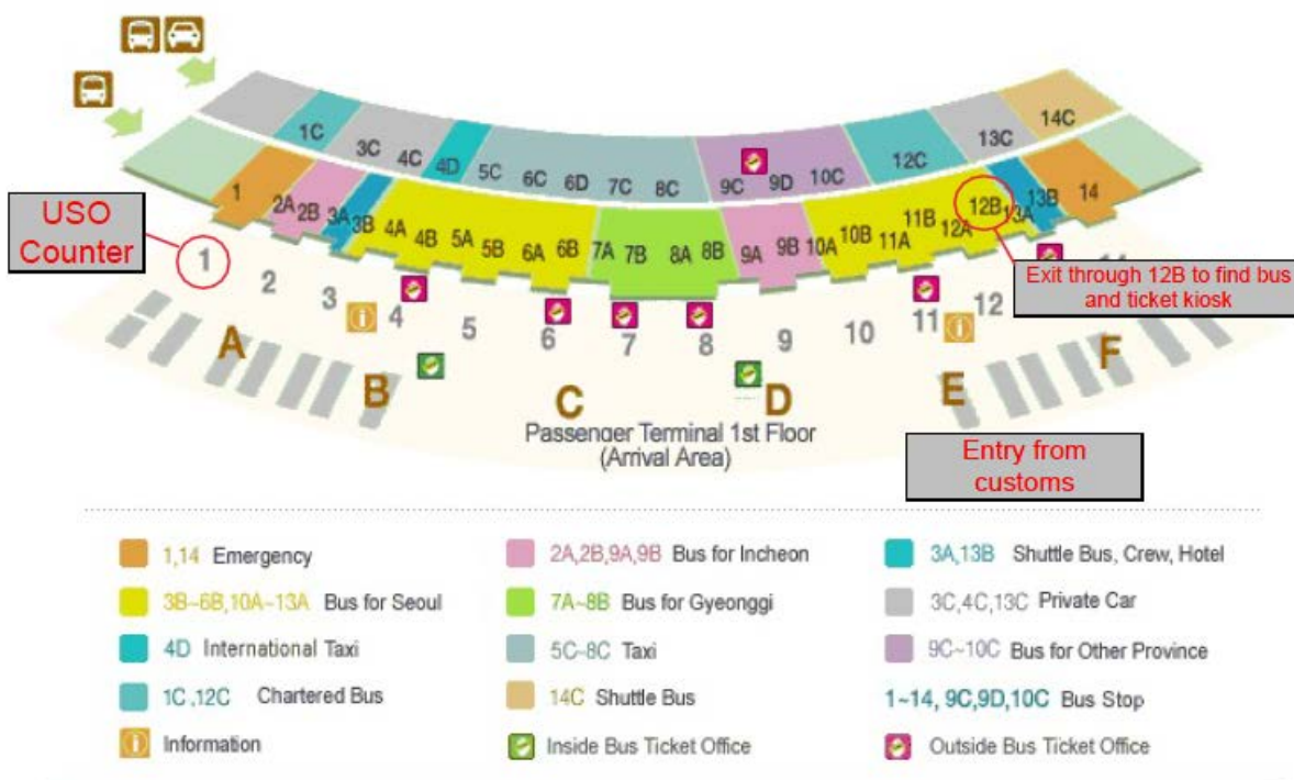
ICN Terminal Map